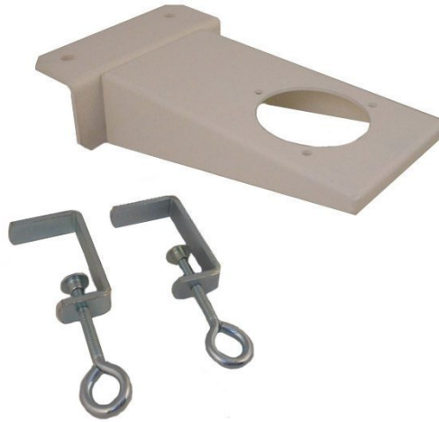
TABLE FIXING KIT FOR EL.MI FUME EXTRACTION ARM